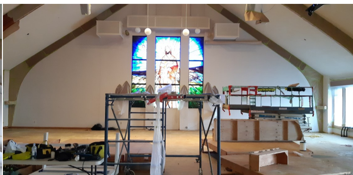
Painting (walls & ceiling) and staining (window trims, wood panels at back) in the Sanctuary . . .