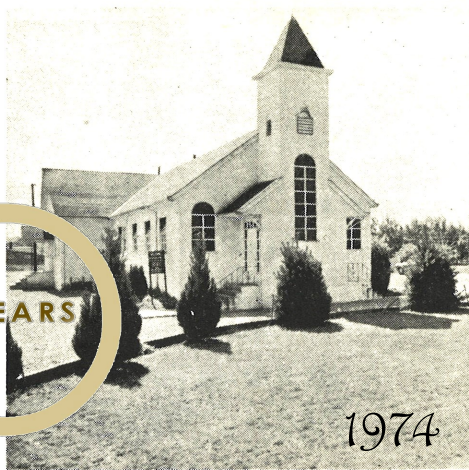
Shepherd of the Valley Lutheran Church