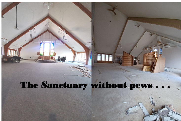
The Sanctuary without pews . . .